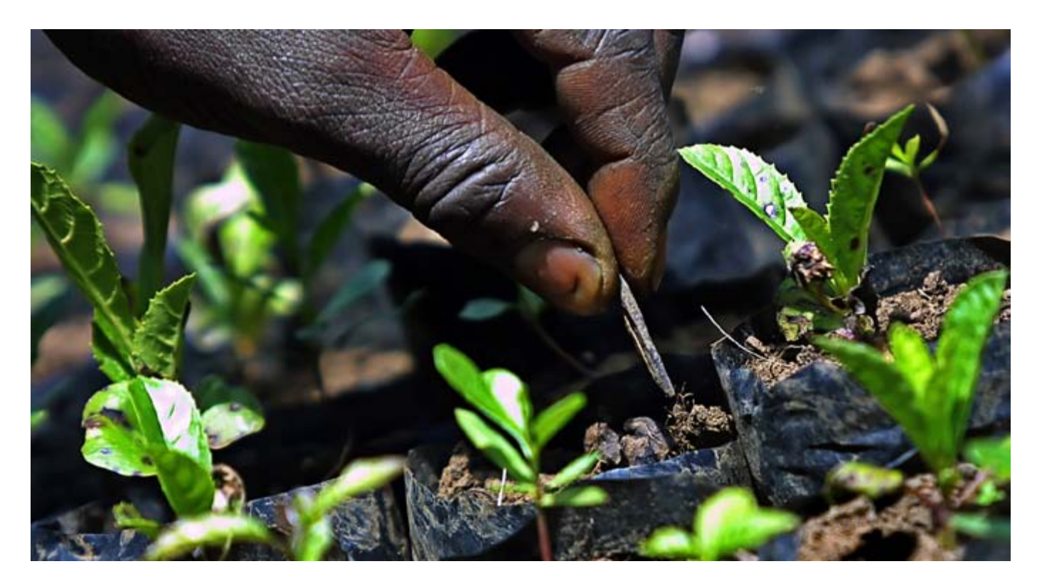
Tending seedlings in Kenya: future prisoners of plant variety protection laws?

Under the rubric "seeds laws" there are various types of legal and policy initiatives that directly affect what kind of seeds small scale farmers can use. We focus on two: intellectual property laws, which grant state-sanctioned monopolies to plant breeders (at the expense of farmers' rights), and seed marketing laws, which regulate trade in seeds (often making it illegal to exchange or market farmers' seeds).<sup>22</sup>