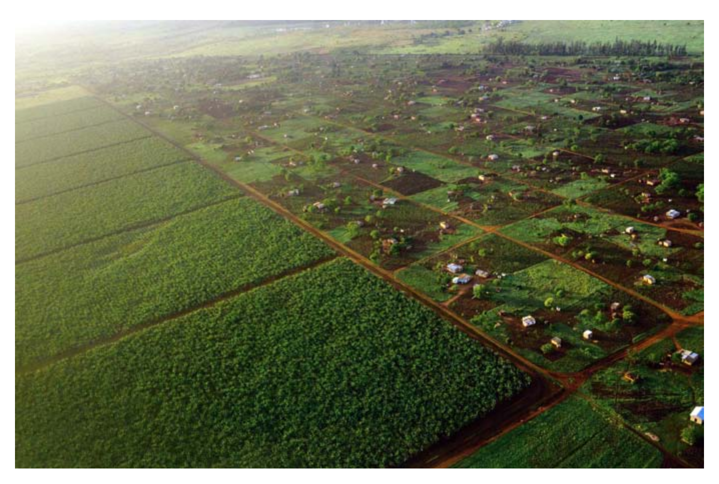
This land outside Maputo, Mozambique provides a snapshot of Africa's agricultural choices: Will its food be produced on small farms or on giant plantations like Bananalandia?