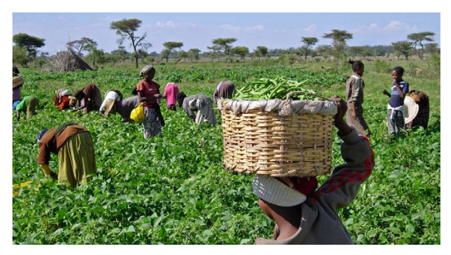
Picking green beans at the USAID-backed Dodicha Vegetable Cooperative in Ethiopia. The beans will be sold to a local exporter, who will sell them to supermarkets in Europe.